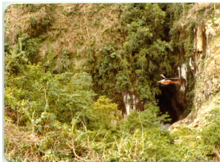
Subterranean river cave entrance PNG