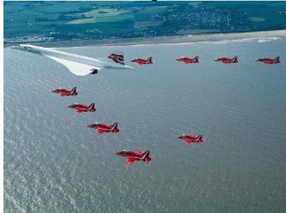
Concorde last flight