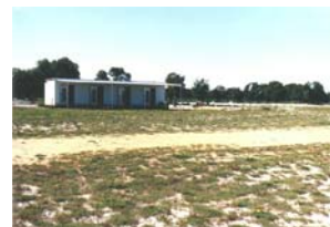
The early years

“They have given around 20 years of faithful service and look it with several permanently out of commission”