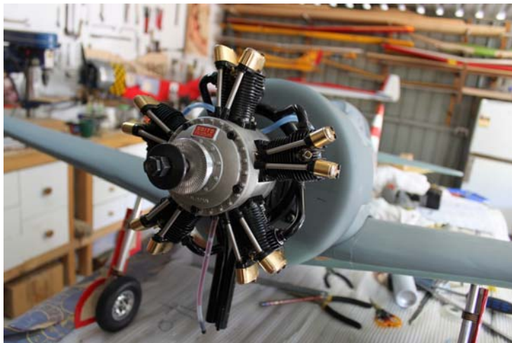
Round & Rattle!!